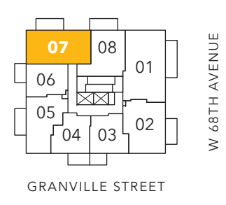
LEVELS 4 - 10