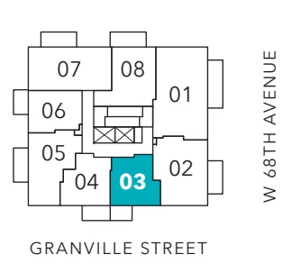
LEVELS 4 - 10